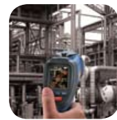
JPG images/3GP videos

Thermal sensitivity 0.15°C (0.27°F) @ 1Hz and 100°C