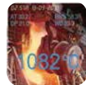
Fold reading on the images