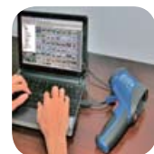
USBinterface & Micro SD memory Card